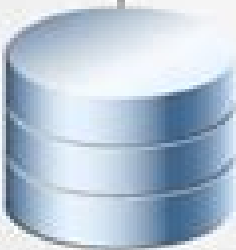
Database with Schemas