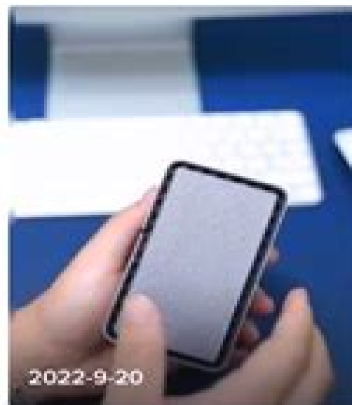
what is it#3c#electronics #digitalproducts#iphone...