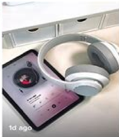
Tai nghe này đẹp quá, nhạc hay quá.#bluetoothheadset #3c...