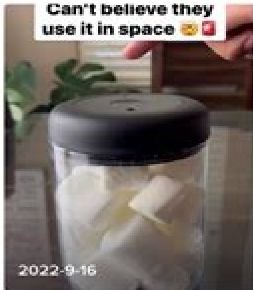
#electronic #products #electronic_products